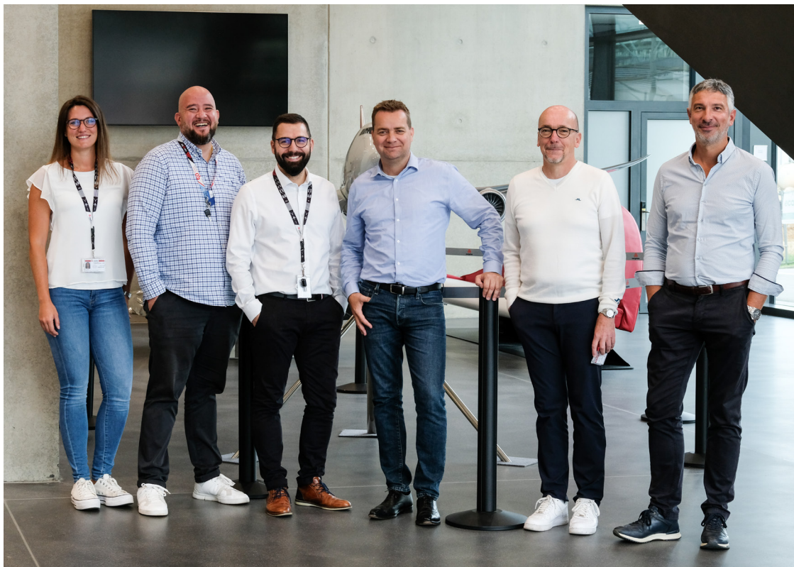
THE LUXEMBOURG-BASED CHARTER TEAM